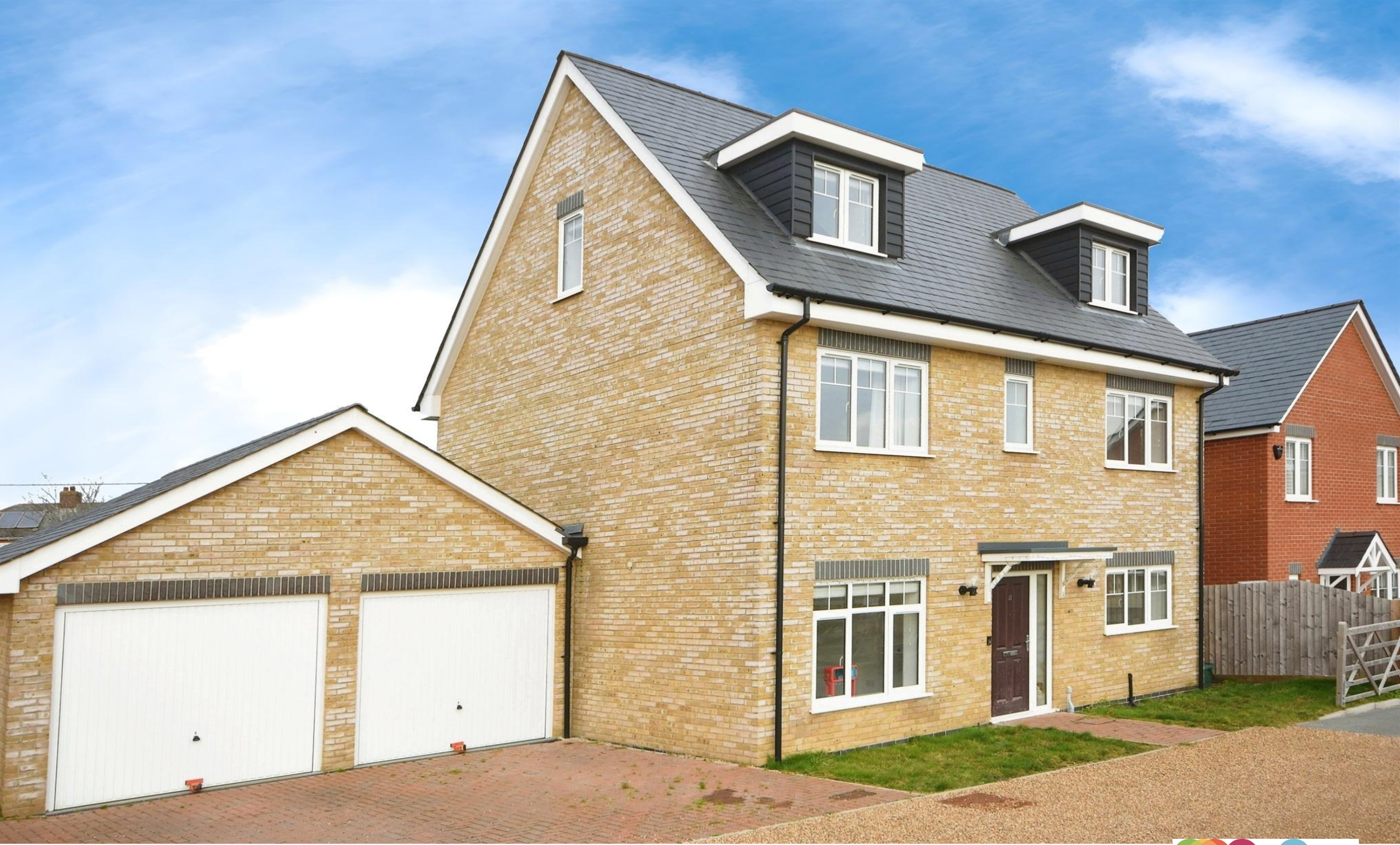
Field View, Wethersfield, Braintree, CM7 4FF