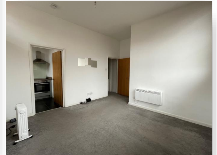
Parkway Court, Southampton Road, Eastleigh. SO50 5QS