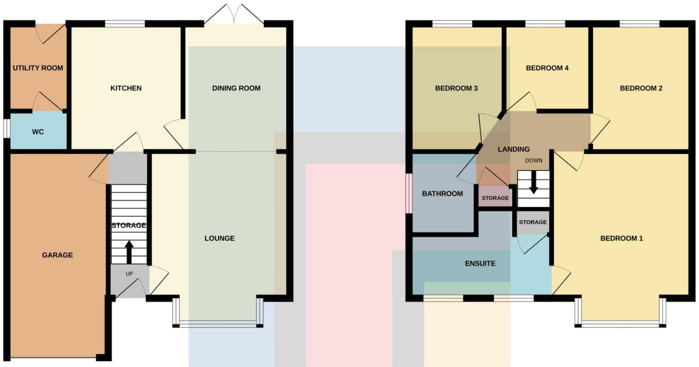
TOTAL FLOOR AREA : 1129 sq.ft. (104.9 sq.m.) approx.

Whilst every attempt has been made to ensure the accuracy of the floorplan contained here, measurements of doors, windows, rooms and any other items are approximate and no responsibility is taken for any error, omission or mis-statement. This plan is for illustrative purposes only and should be used as such by any prospective purchaser. The services, systems and appliances shown have not been tested and no guarantee as to their operability or efficiency can be given. Made with Metropix ©2025