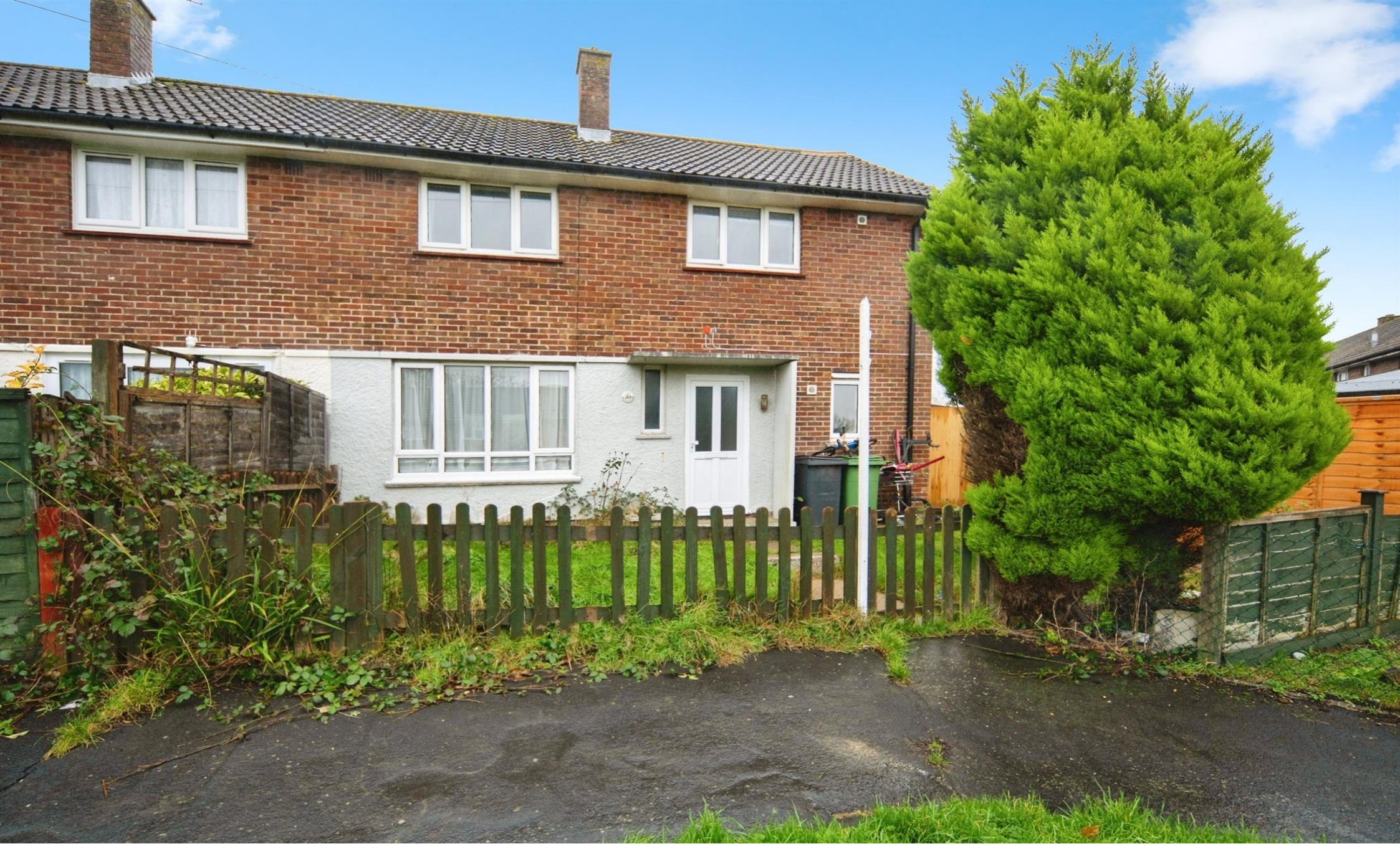
The Slides, St. Leonards-On-Sea TN38 9LE