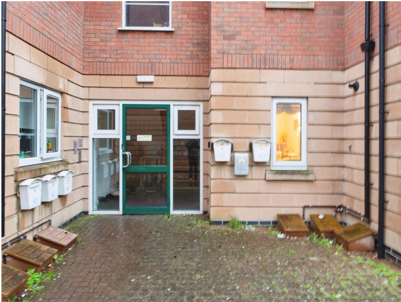
The Hedgerows, Sleaford NG34 8RE