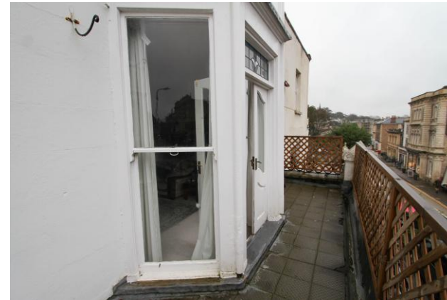
81A Hill Road, Clevedon BS21 7PL Approx. Gross Area 1185.30 Sq. Ft - 110.10 Sq.M