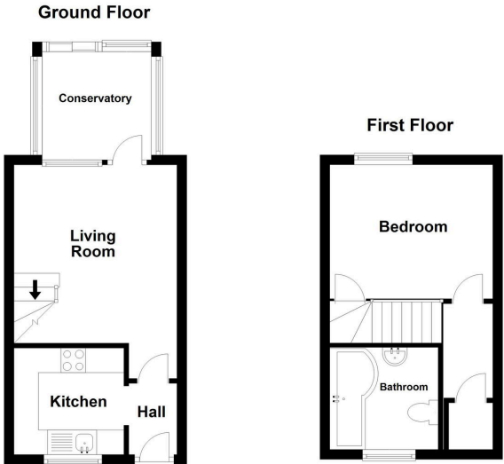
This plan is to be used only as an indication of the floor layout and is not to scale. Plan produced using PlanUp.