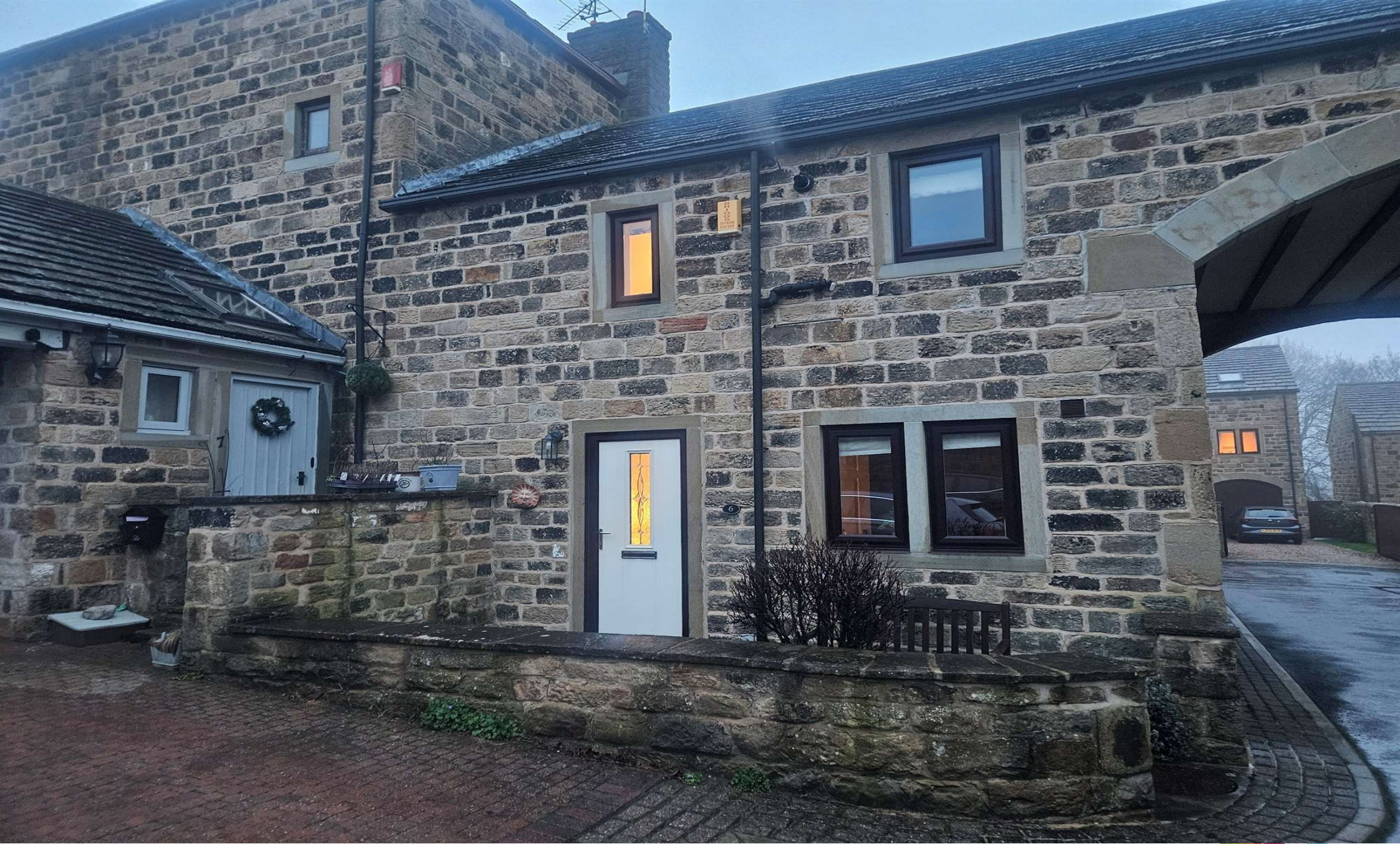
Old Mount Farm, Woolley Wakefield WF4 2LD