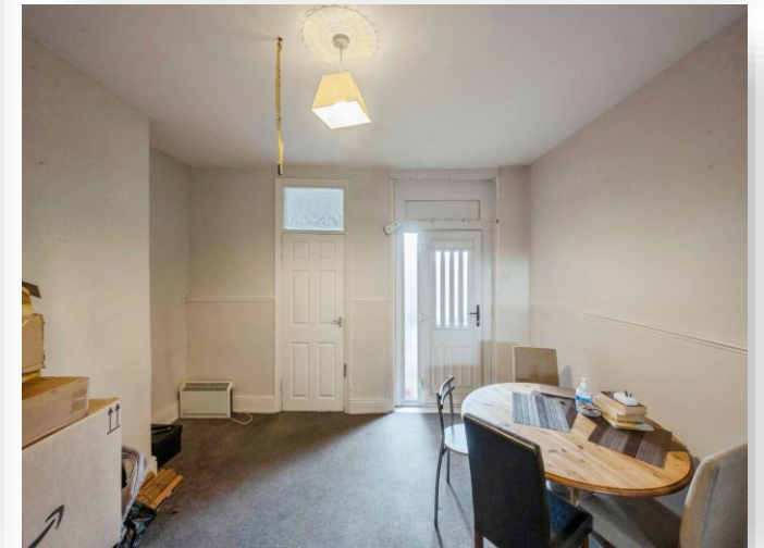
Station Road, Bolton-Upon-Dearne Rotherham S63 8AB