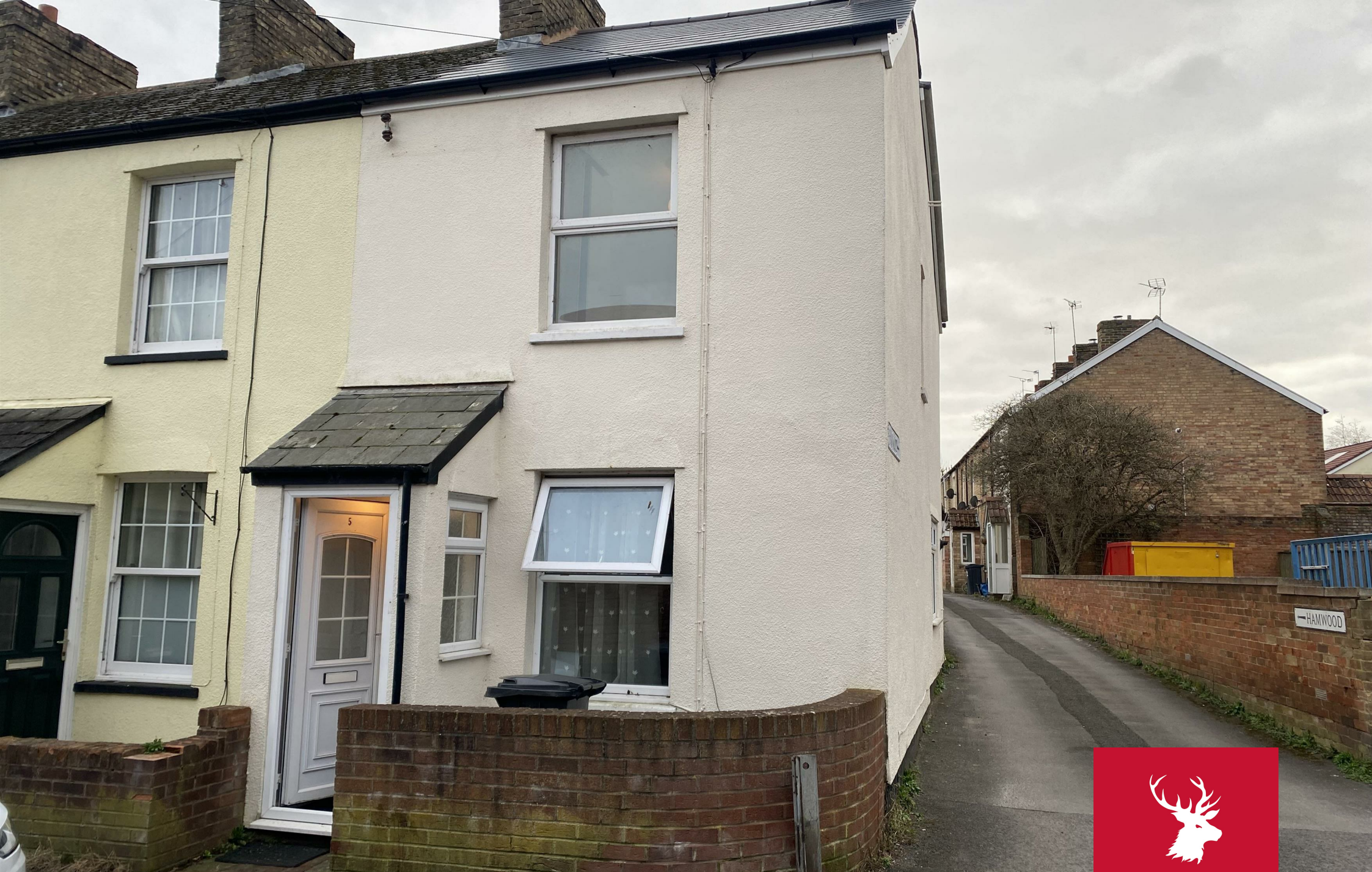
5 Hamwood Terrace