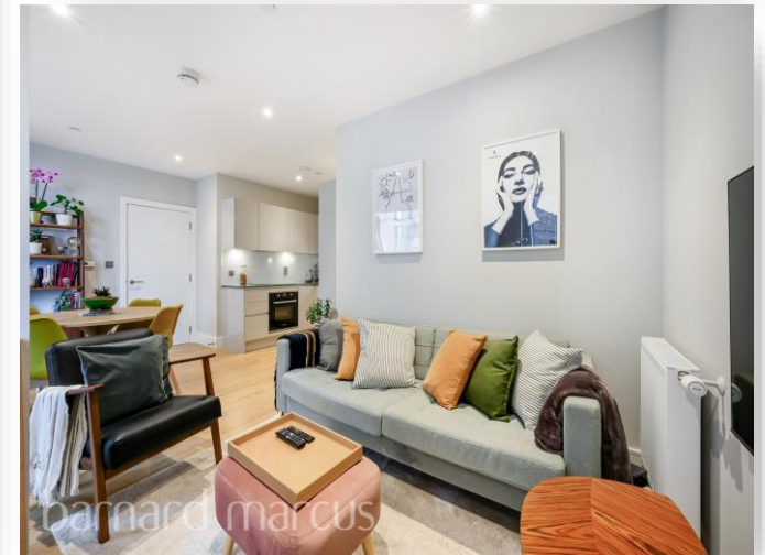
Keel Apartments, Greyhound Parade, London SW17 0GY