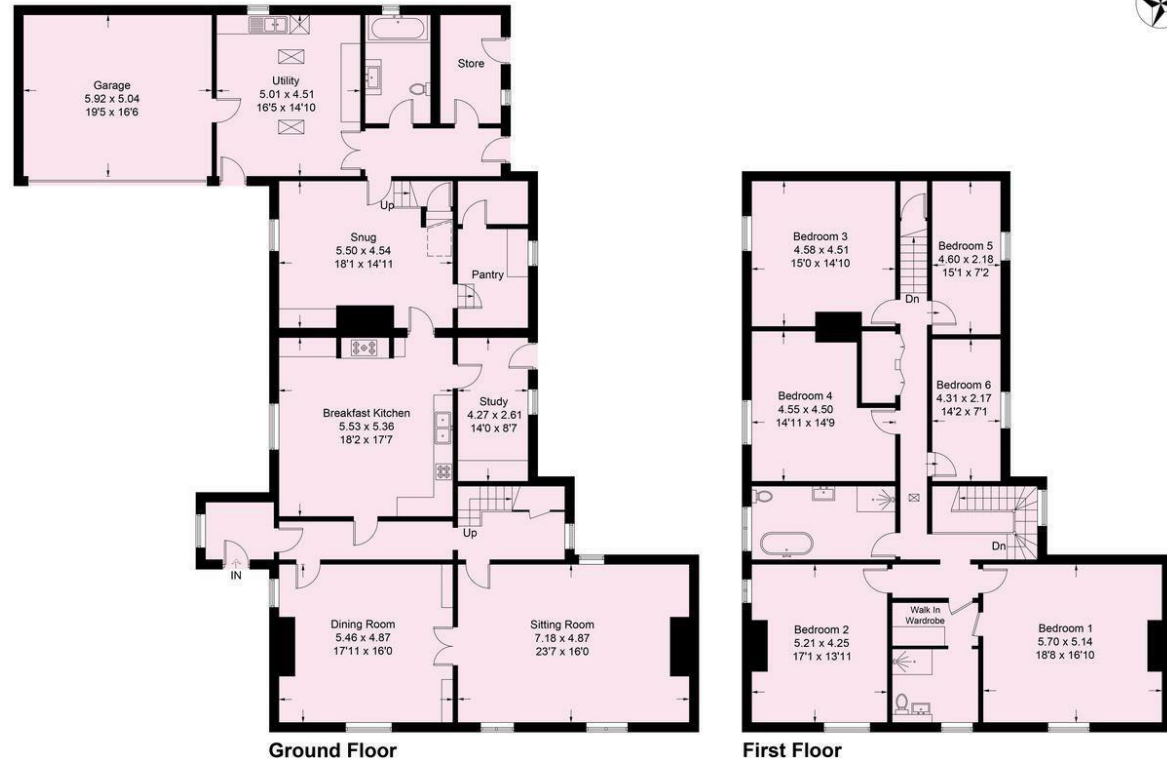
illustration for identification purposes only. measurements are approximate, not to scale Pursuant to RICS Property Measurement 2nd Edition © Intelligent Property Marketing 2026

Situated to the West of York, this immaculate Georgian farmhouse has been thoughtfully and sympathetically updated by the current owners to create an exceptional family home which enjoys the best of countryside living, whilst remaining within easy reach of excellent local amenities and transport links.