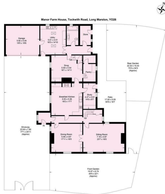
Illustration for identification purposes only, measurements are approximate, not to scale Pursuant to RICS Property Measurement 2nd Edition © Intelligent Property Marketing 2026