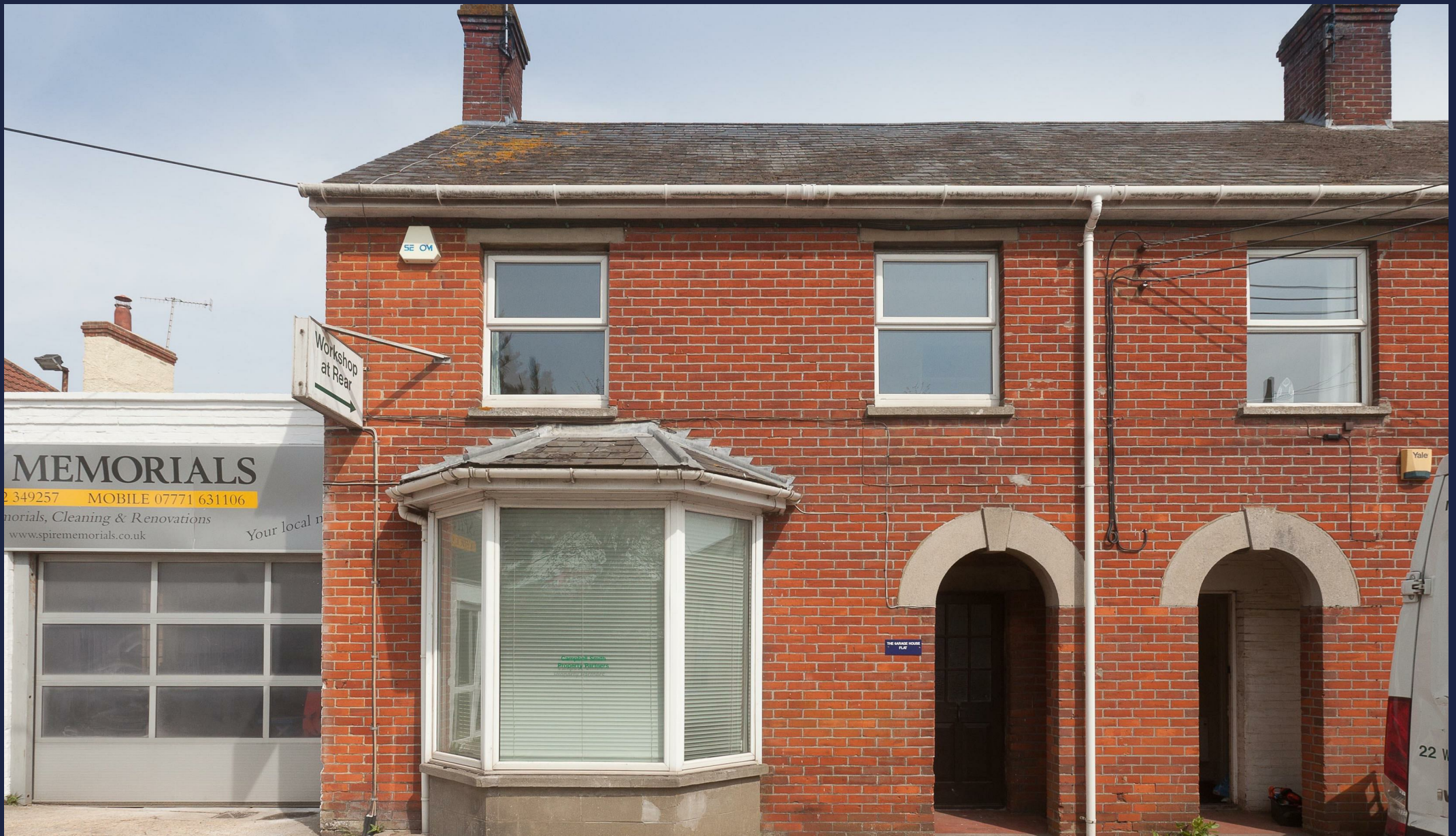
The Garage House Flat, Warminster Road, Salisbury