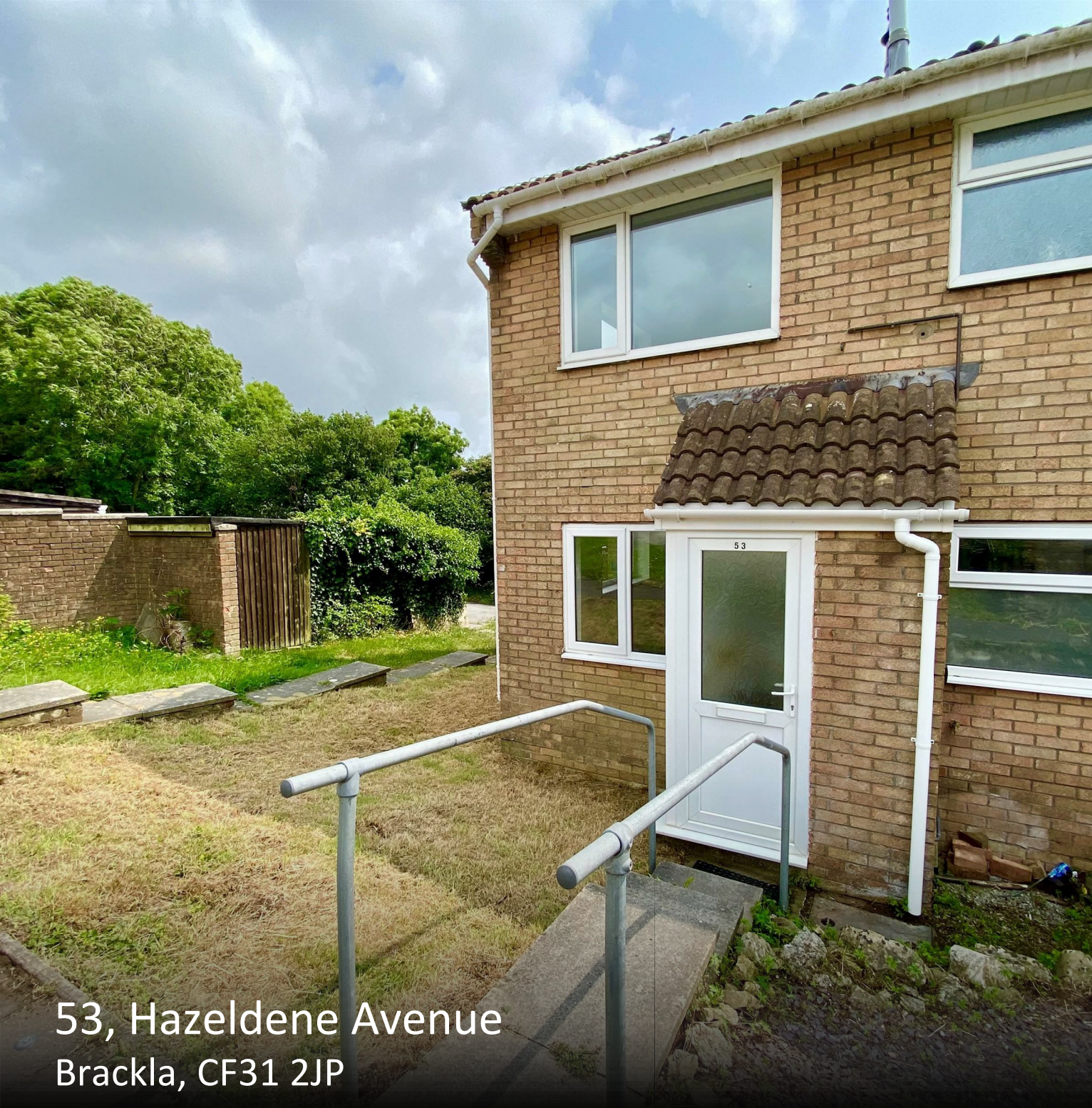
53, Hazeldene Avenue Brackla, CF31 2JP