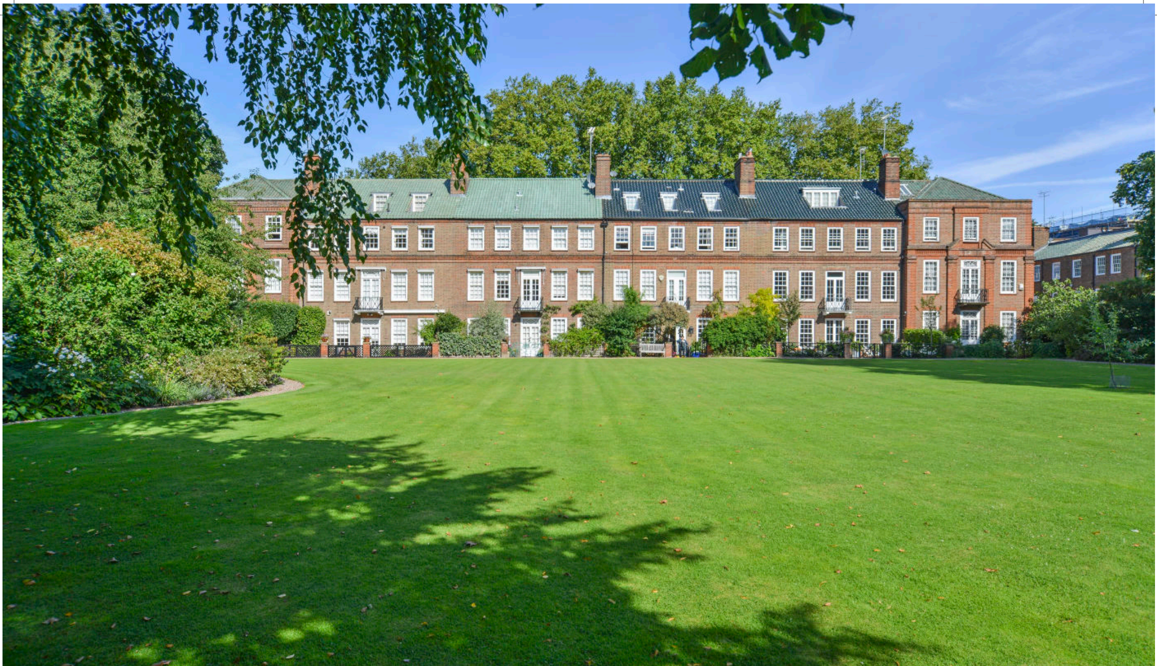
Chelsea Square, Chelsea SW3