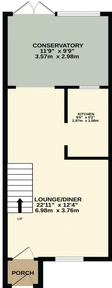
GROUND FLOOR 417 sq.ft. (38.8 sq.m.) approx.