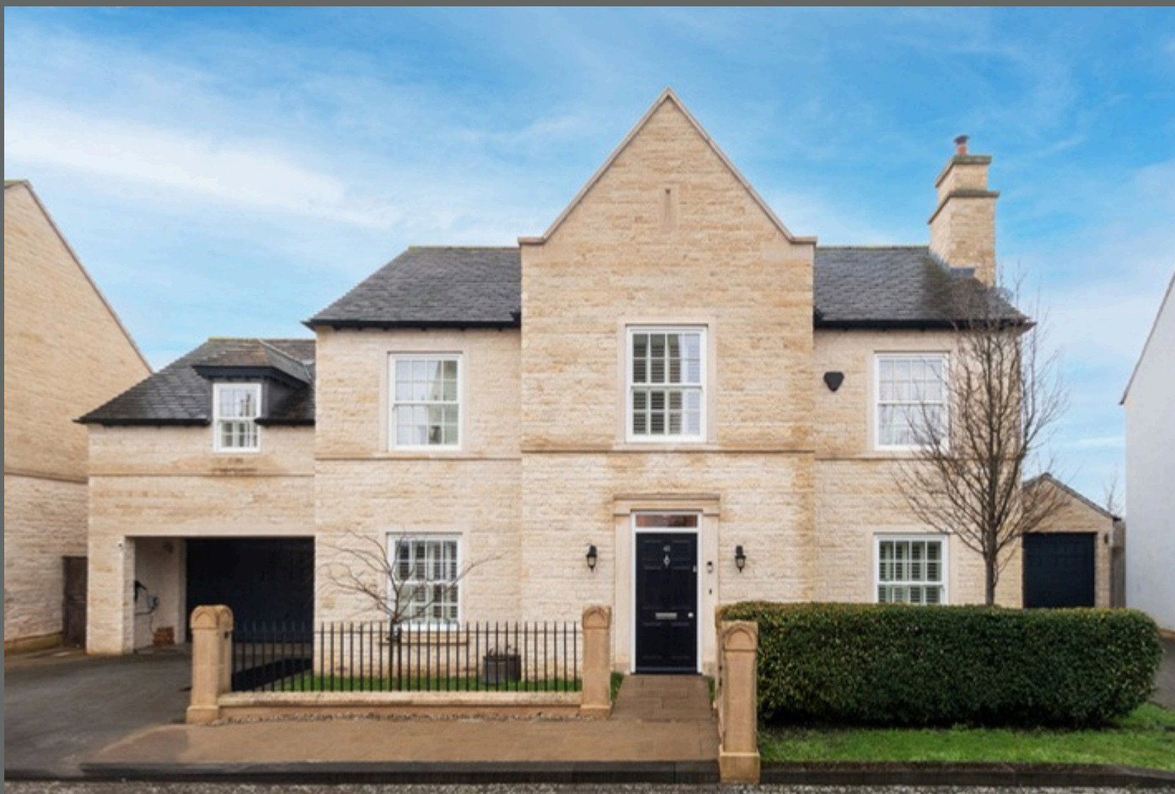
45 Hereward Place Stamford