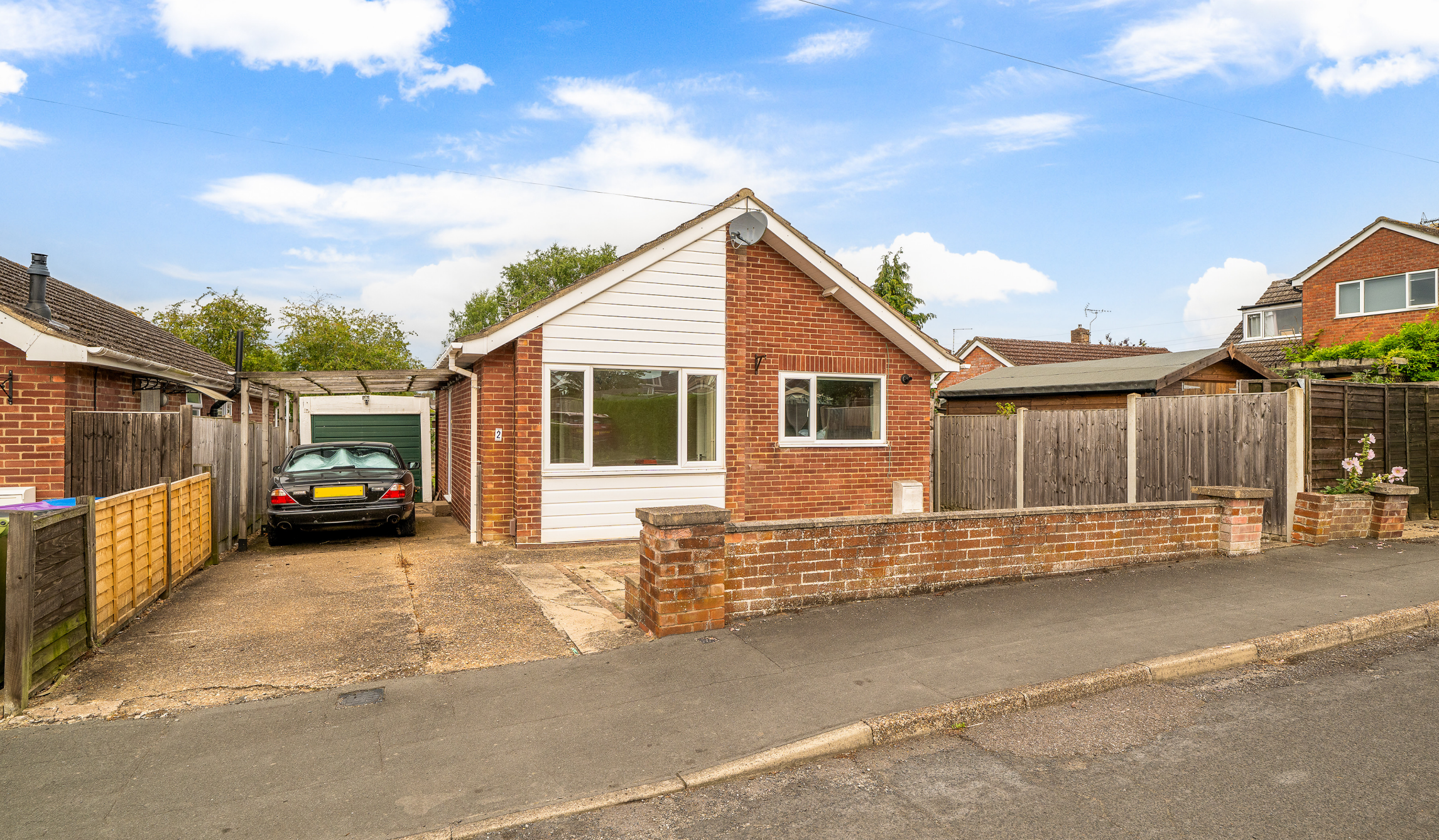
2 Sycamore Close Cherry Willingham, Lincoln