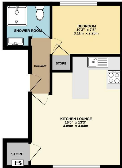
TOTAL FLOOR AREA : 347 sq.ft. (32.2 sq.m.) approx. Measurements are approximate. Not to scale. Illustrative purposes only Made with Metropix ©2024

View all of our residential properties for sale on the internet website: www.rightmove.co.uk