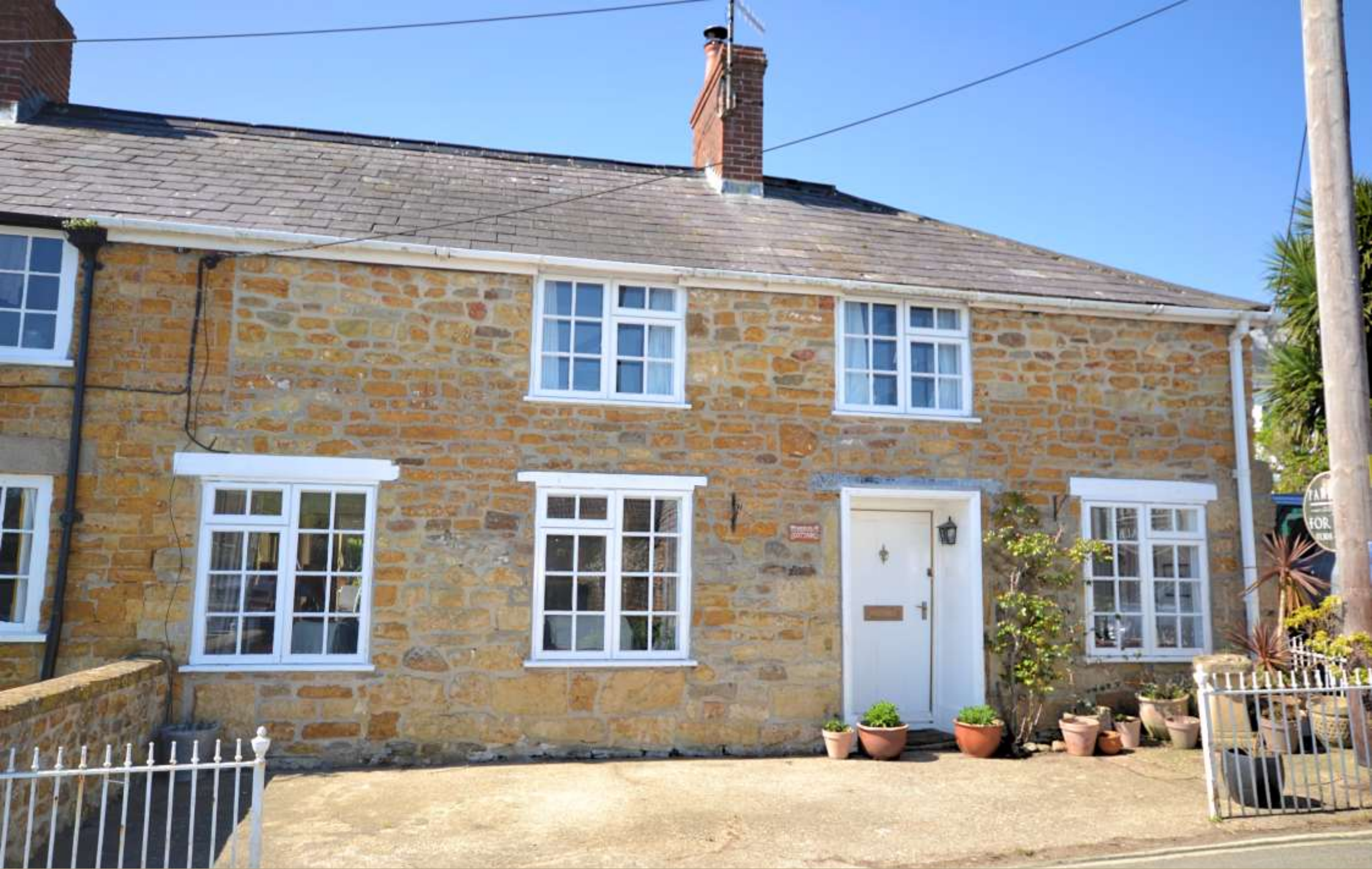
Chervil Cottage Chideock £390,000