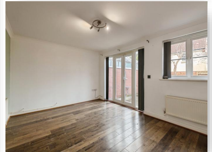
Holm View, Watchet, TA23 0AF