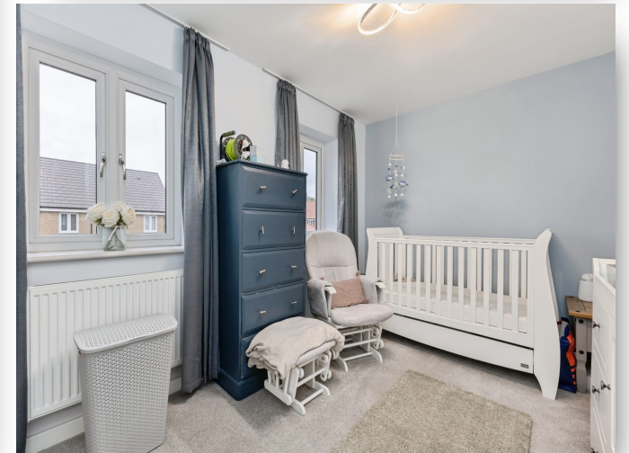
Halifax Close, Attleborough, NR17 1FY