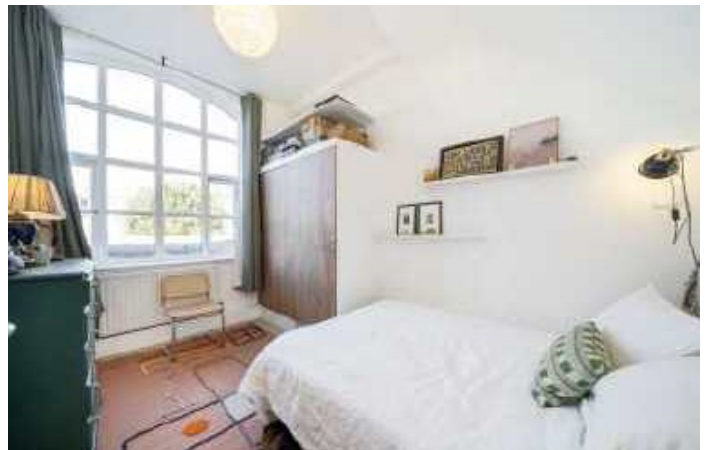
Independent Place, E8