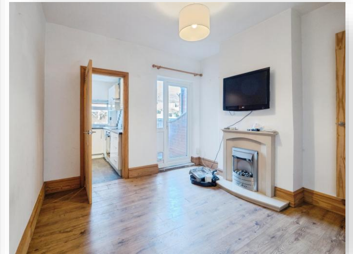
King Street, Loughborough