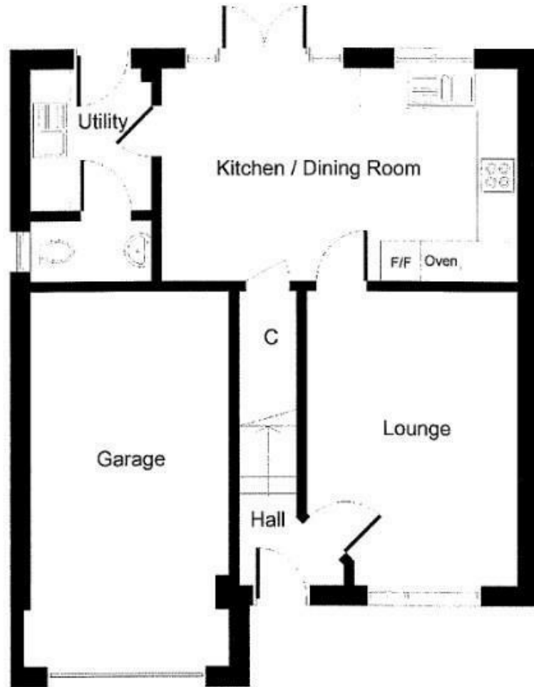
Ground Floor Approximate Floor Area (Including Garage) 608 Sq. ft. (56.48 Sq. m.)

Whilst every attempt has been made to ensure the accuracy of the floor plan contained here, measurements of walls, windows, doors and any other items are approximate and no responsibility is taken for any error, omission or mis-statement. The measurements should not be relied upon for valuation, insurance or other financial purposes. This plan is for illustrative purposes only and should be used as a guide only. Any prospective purchaser or tenant should verify the accuracy of the floor plan and any other information provided by the seller or agent. The services, systems and appliances shown have not been tested and no guarantee as to their condition or efficiency can be given.