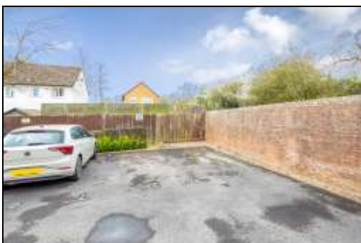
Allocated Parking Space