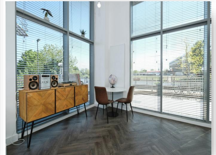
Trent Bridge View, Nottingham NG2 3EZ