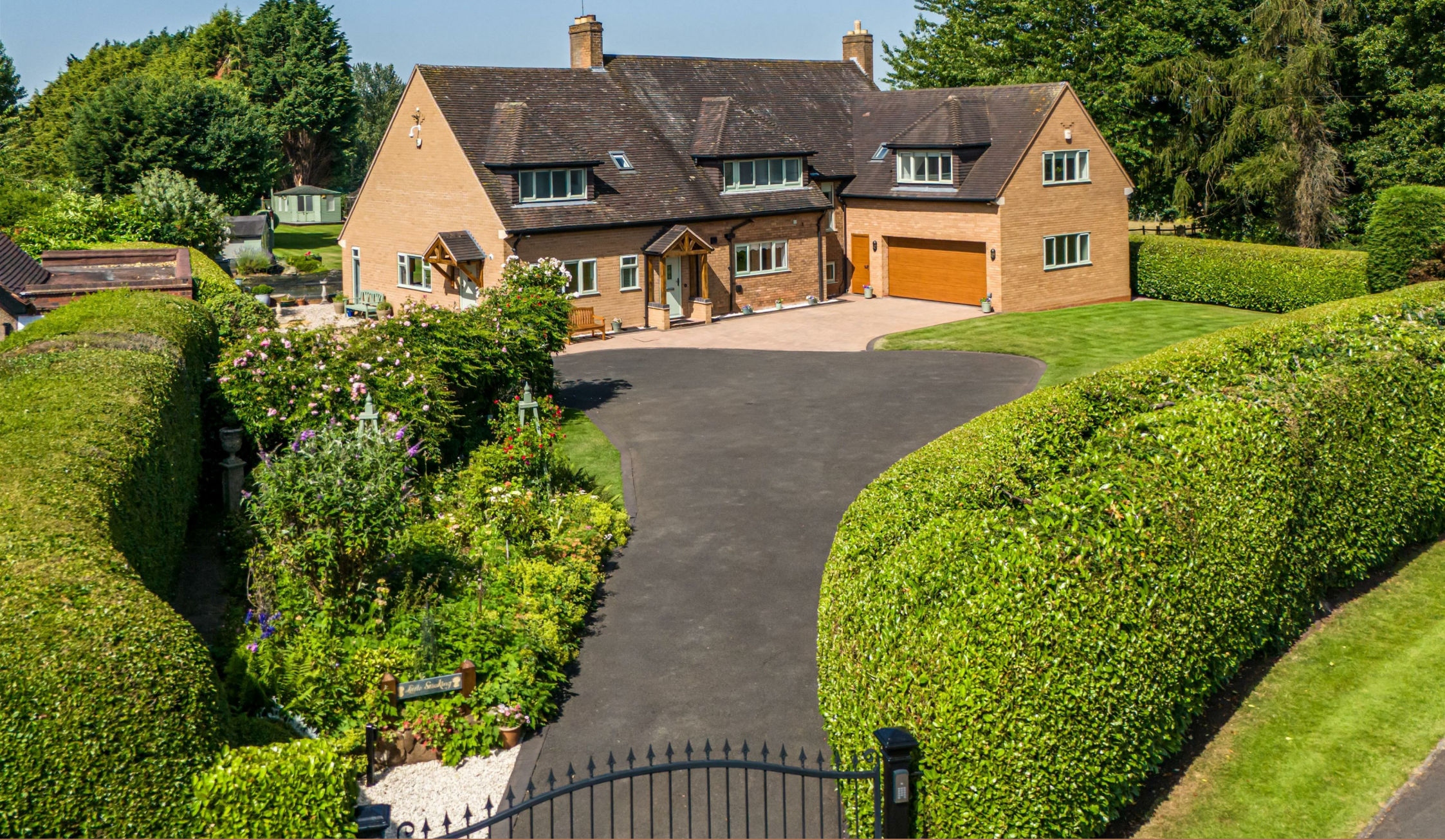
Little Stoking, 69 Codsall Road, Tettenhall, Wolverhampton, WV6 9QG