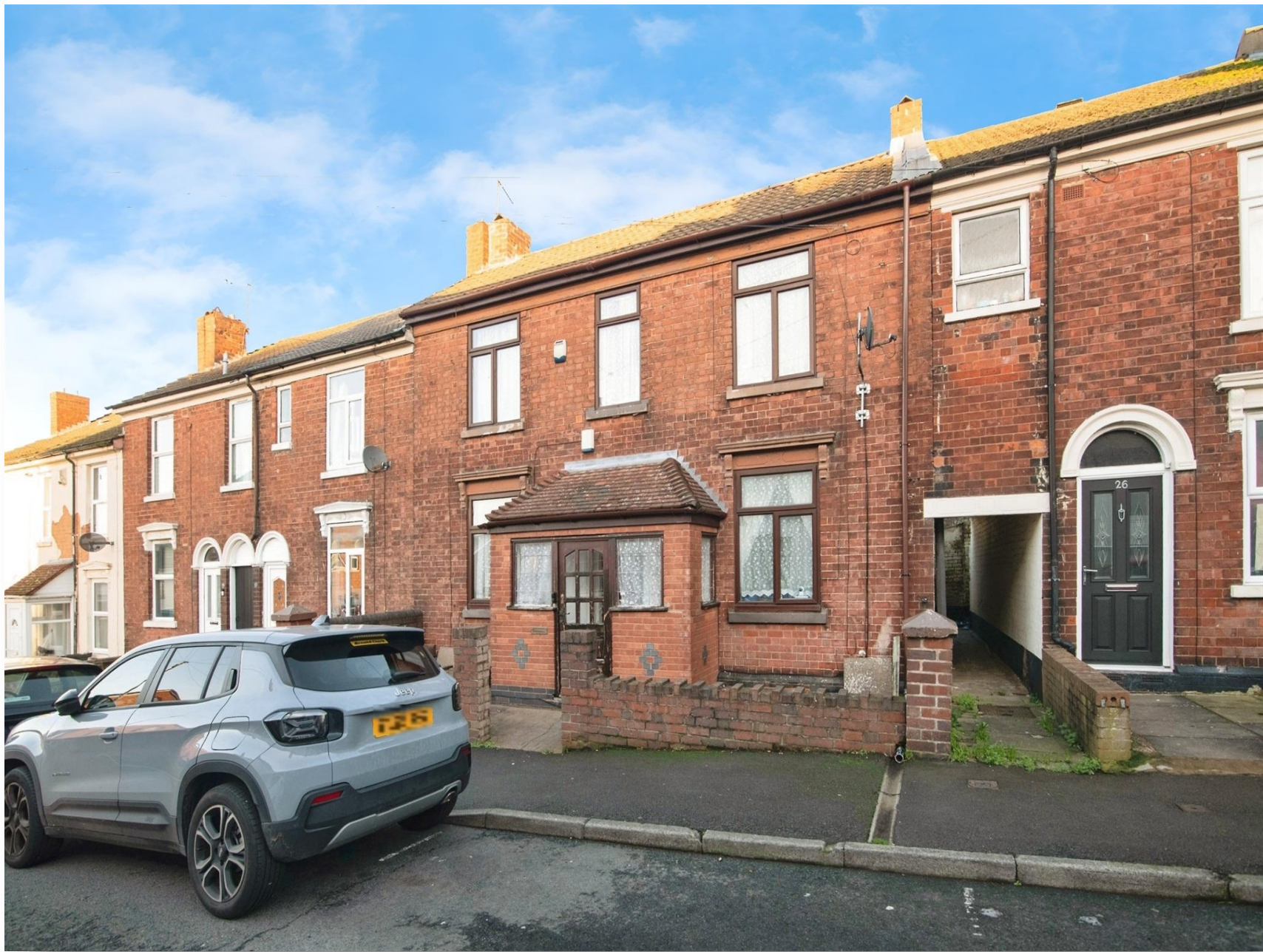
Caroline Street,Dudley DY2 7DY