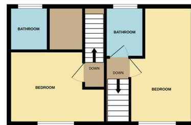
2ND FLOOR 397 sq.ft. (36.9 sq.m.) approx.