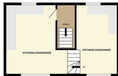
1ST FLOOR 397 sq.ft. (36.9 sq.m.) approx.