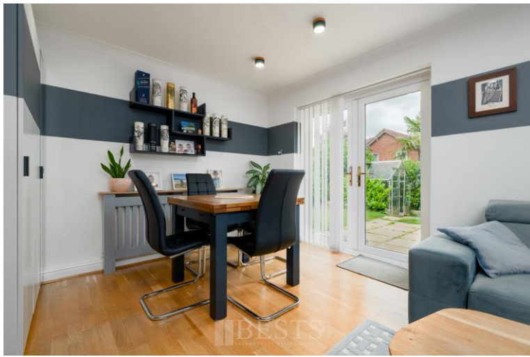
Dining Area 9' 8" x 8' 9" (2.94m x 2.66m)

Real wood flooring, coved ceiling, double panel radiator, one single power point, fitted light well.