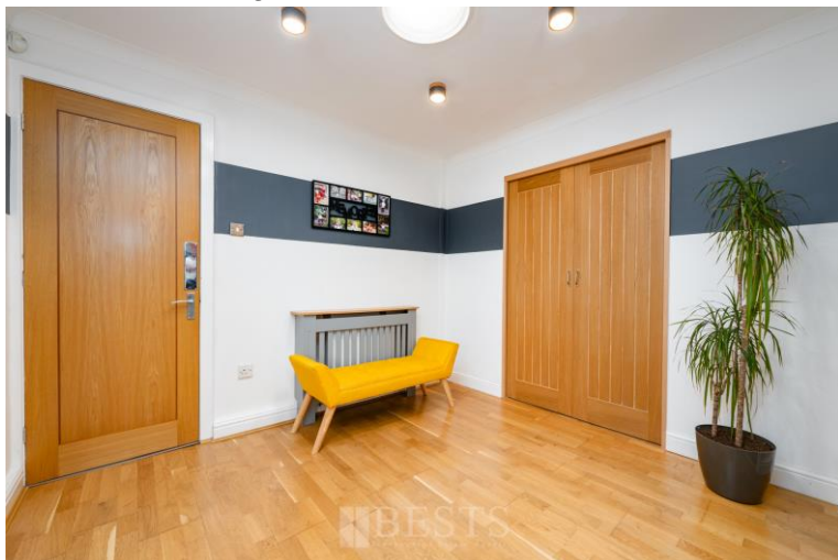
Additional Reception Room 10' 7" x 9' 1" (3.22m x 2.77m)

Currently arranged as a bedroom having PVC double glazed window to side elevation, two fitted Velux roof lights, real wood flooring, tall contemporary style double panel radiator, three double power points.