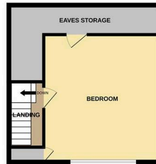
2ND FLOOR 363 sq.ft. (33.7 sq.m.) approx.