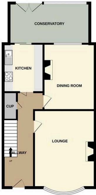
GROUND FLOOR 676 sq.ft. (62.8 sq.m.) approx.