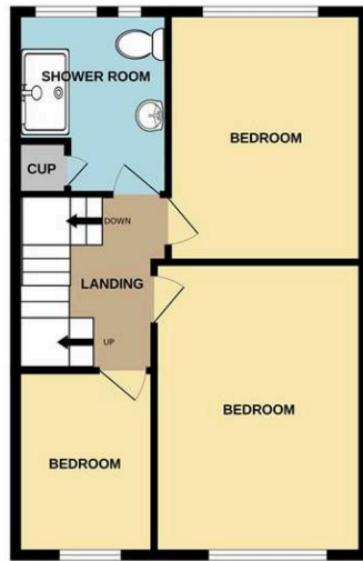
1ST FLOOR 547 sq.ft. (50.8 sq.m.) approx.