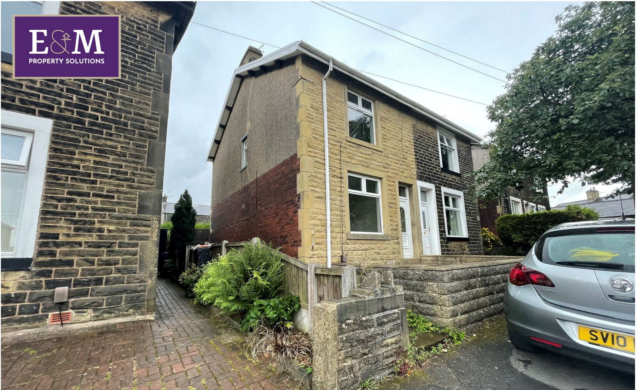
81 Ethersall Road, Nelson, Lancashire, BB9 0RP £765 Per month