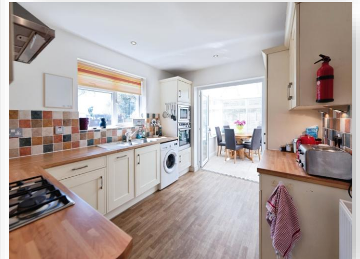
Sutton Road, Waterlooville PO8 8QA