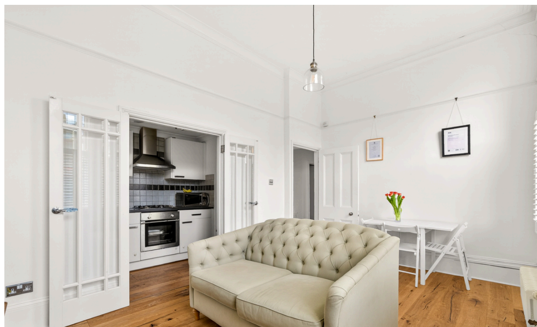
Fourth Avenue, Hove, BN3 2PL Asking Price £320,000