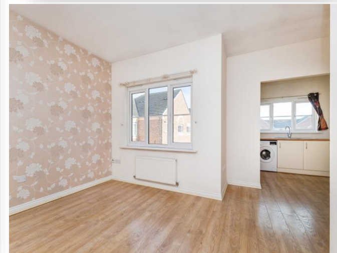
Rockingham Court, Middlesbrough TS5 7BN