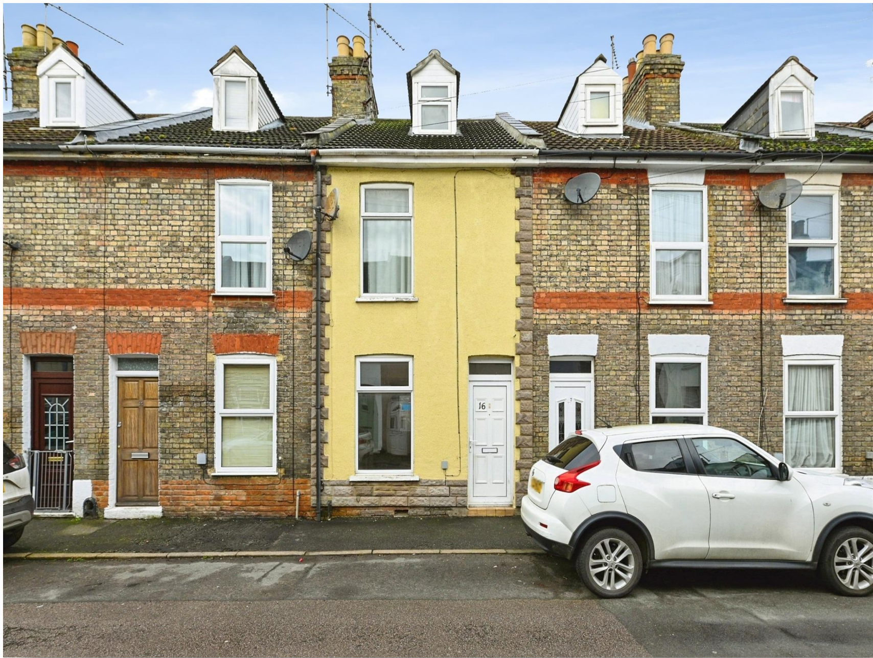
Birchwood Street, King's Lynn, PE30 2AG