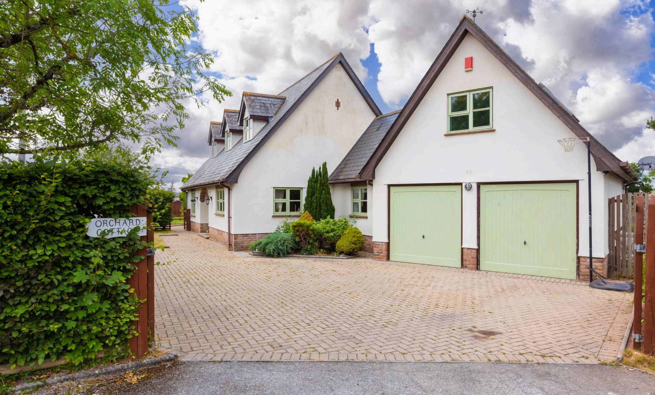
Orchard Cottage, Tedburn St. Mary £1,825 pcm