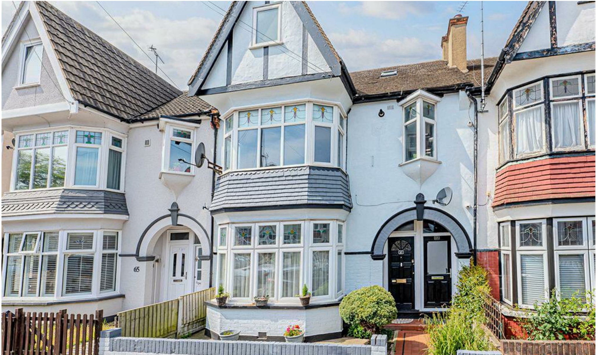
Oakleigh Park Drive, Leigh-On-Sea £325,000