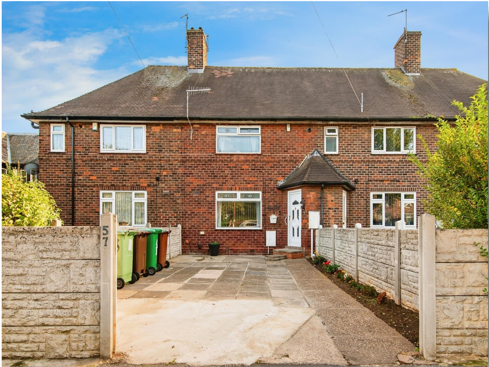
Aspley Lane, Nottingham NG8 5RX