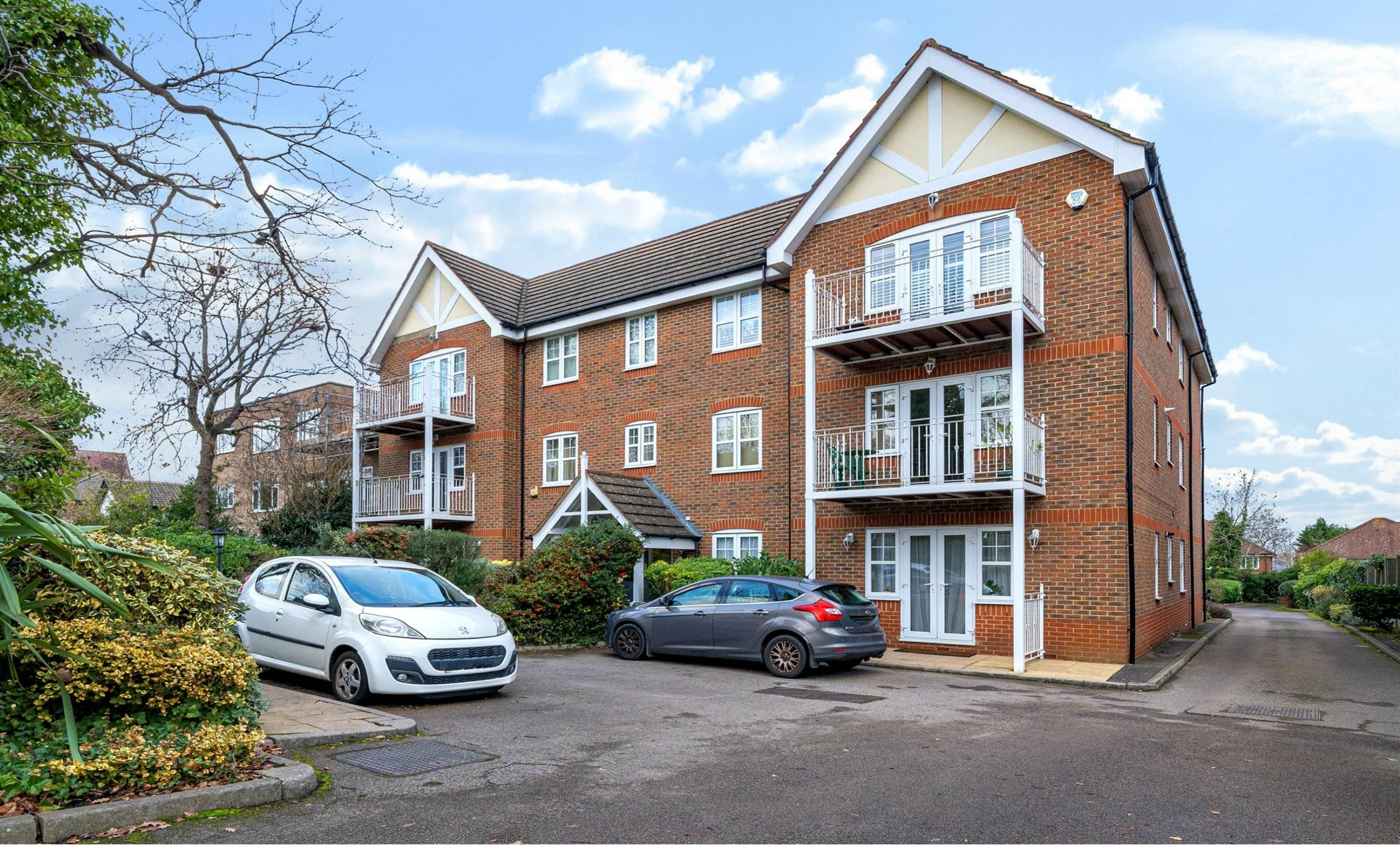
Langton Court, The Ridgeway, Enfield, EN2 8PD