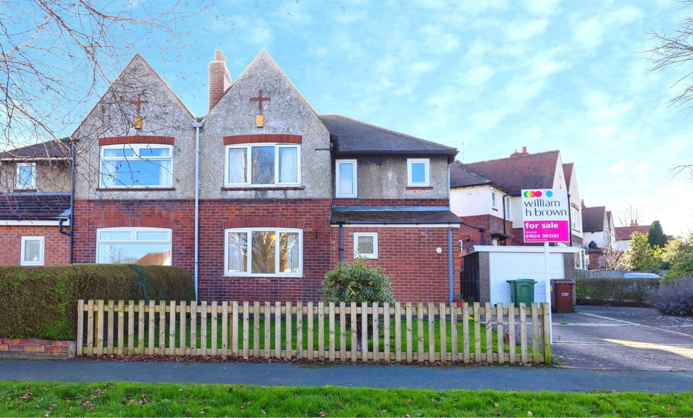
Mount Crescent, WAKEFIELD WF2 8QG