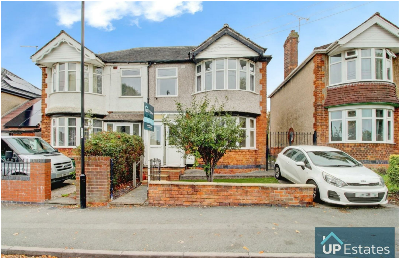
Attoxhall Road, Coventry