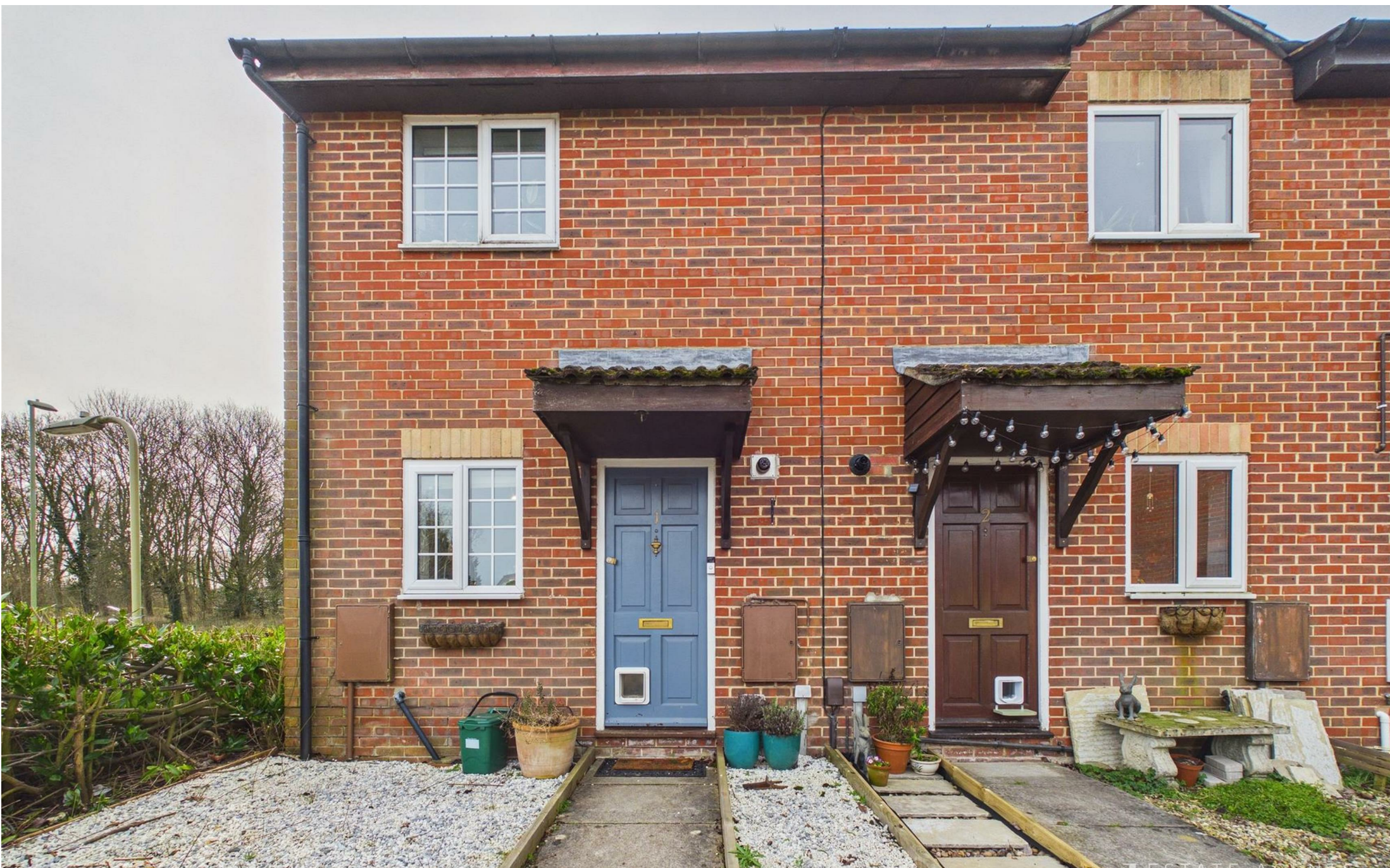
Vivaldi Close, Brighton Hill, Basingstoke, RG22 4YP