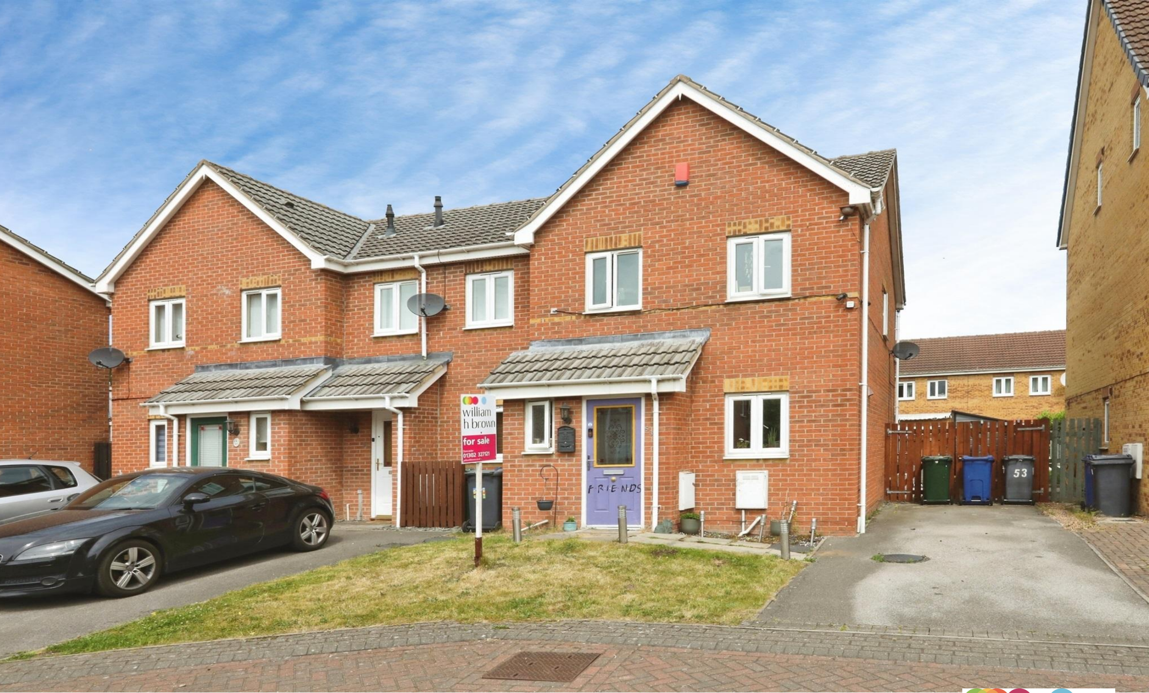
Walstow Crescent, Armthorpe Doncaster