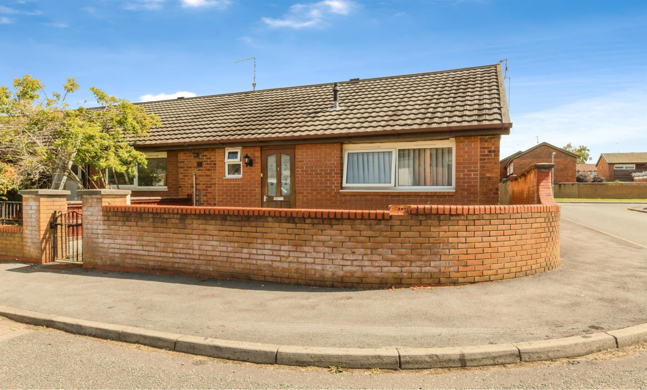
Victoria Square, Winsford CW7 2YL