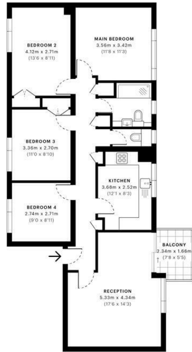
— First Floor

GROSS INTERNAL AREA (GIA) The footprint of the property 91.79 sqm / 988.02 sqft