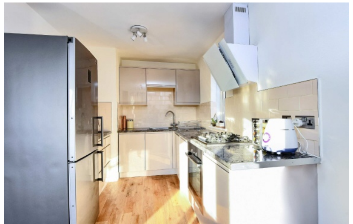
Leerdam Drive, E14