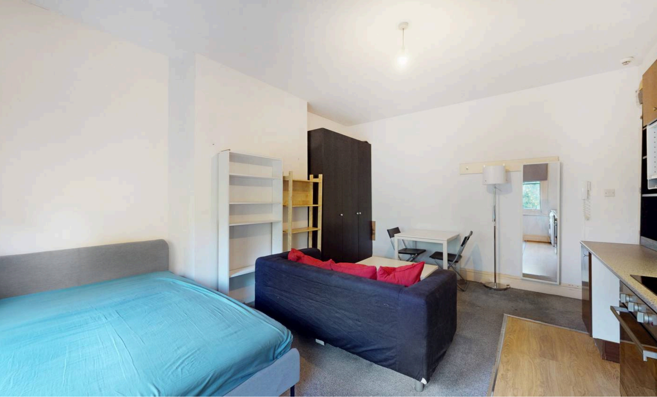
Goldhurst Terrace, South Hampstead, NW6 £1,300 pcm