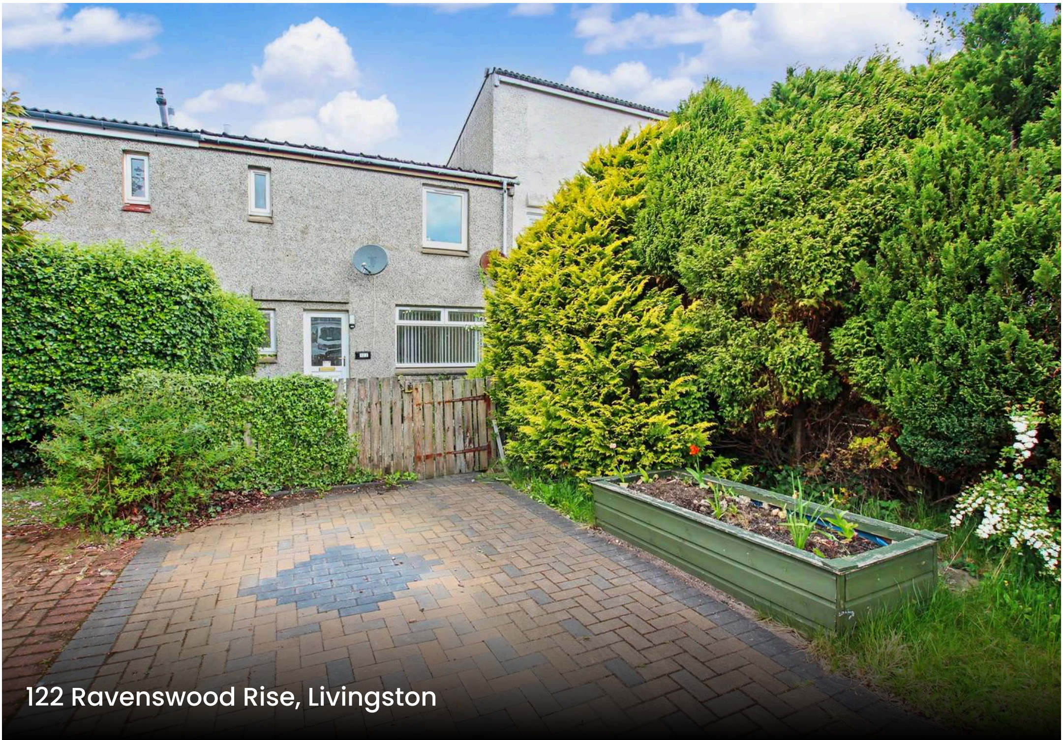
122 Ravenswood Rise, Livingston